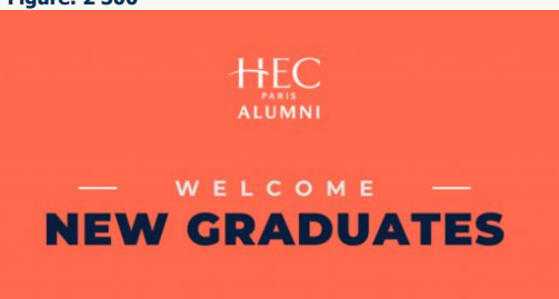
Figure: 2 300